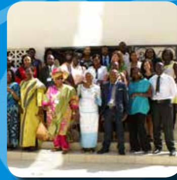
Regional Conference on Women, Peace, Security and Development in the Great Lakes Region, hosted by the Government of Burundi, in coordination with the Office of the Special Envoy on the Great Lakes Region July 2013