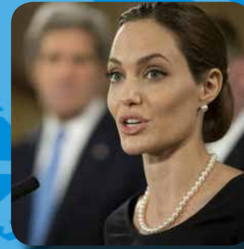
London conference on Violence Against Women and Children in Emergencies, organised in London by the United Kingdom's Department for International Development 13 November 2013