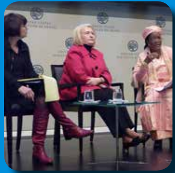
Symposium on Sexual Violence, "The Missing Peace Symposium", organised by the United States Institute of Peace in Washington, D.C. 14 - 16 February 2013