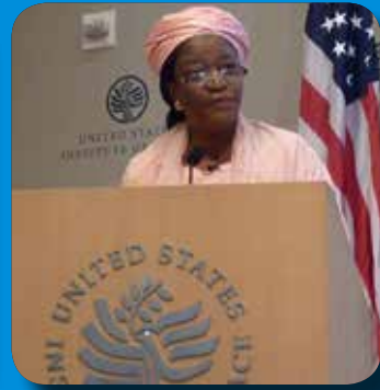
Mission to Washington, D.C. with SRSO-SVC 25 April 2013