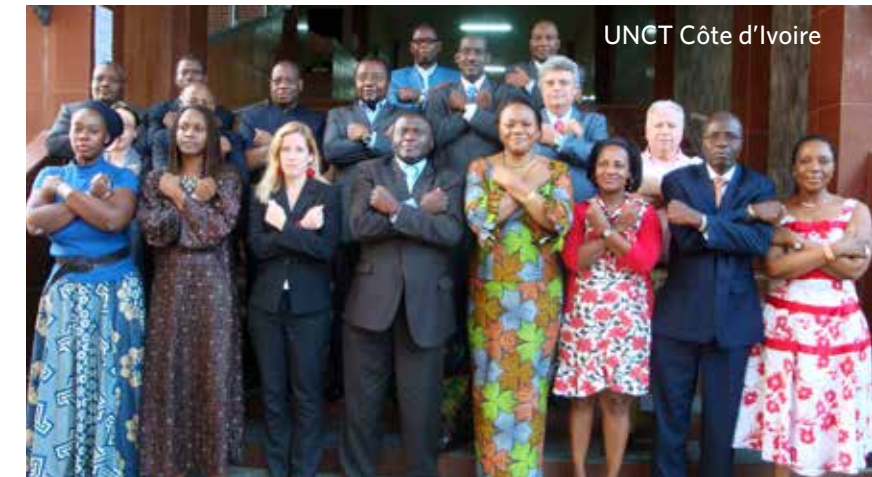
UNCT Côte d'Ivoire

The TOE has benefitted from partnerships with international and regional organizations, including the intergovernmental facility Justice Rapid Response, which manages a stand-by roster of criminal justice professionals, as well as advocacy groups and research institutions.