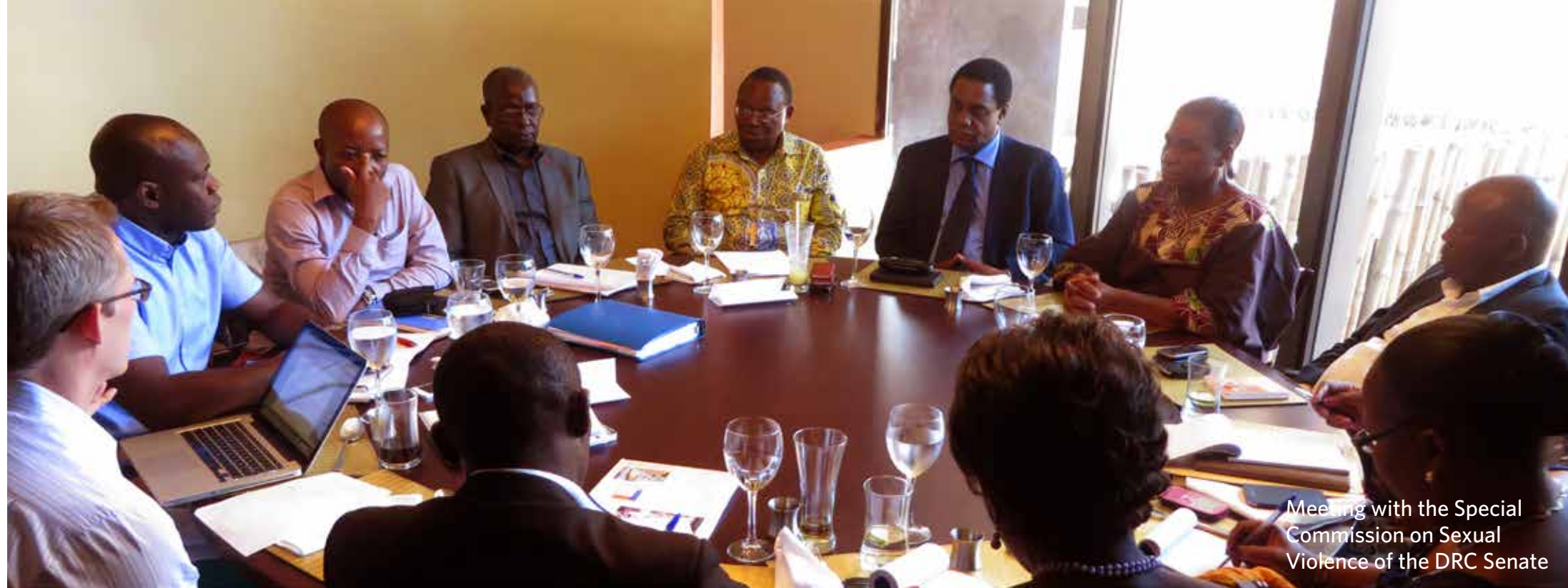
Meeting with the Special Commission on Sexual Violence of the DRC Senate