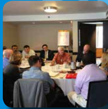
Conference on Male Directed Sexual Violence, organised by the Office of the SRSO-SVC and the US Department of State in New York 25-26 July 2013