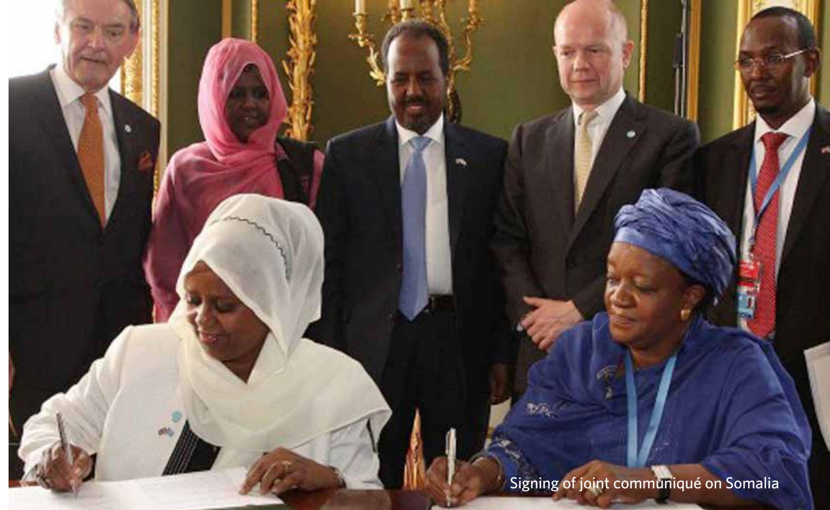
Signing of joint communiqué on Somalia

Since the signing of the joint communiqué, Somalia has adopted a Post-Transition Human Rights Road Map for the period of 2013 to 2015 and a Compact (the "New Deal"), both of which strongly build on the necessity to address human rights concerns, including those affecting women and children, and ensure accountability for human rights violations. In addition, the National Parliament has established a Sub-Committee on Human Rights. More recently, Somalia has created a Ministry of Women and Human Rights for the first time. These institutional structures provide a good foundation to deliver practical solutions to address sexual violence in conflict.