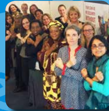
UN Action Strategic Planning Meeting, held in New York 21-22 October 2013