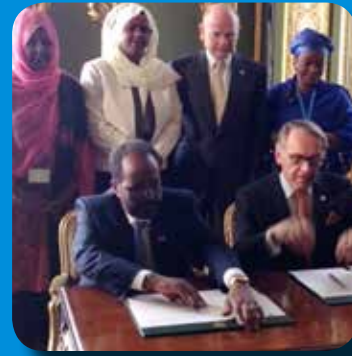
International Conference on Somalia, hosted by the UK Government 7 May 2013