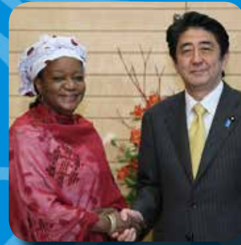
Mission to Japan with SRSO-SVC 18-23 November 2013