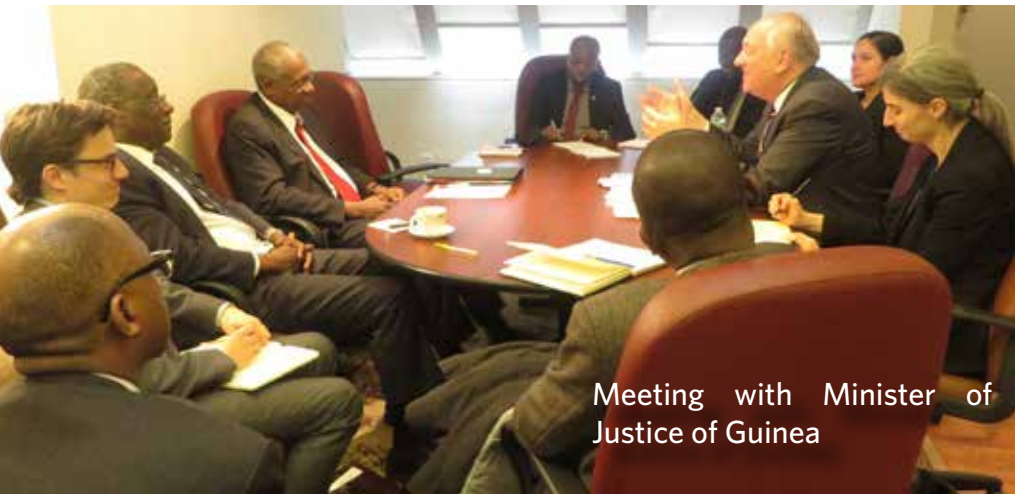
Meeting with Minister of Justice of Guinea

Maître Bal Ahmedou Tidjane Judicial Expert supporting the Panel of Judges Lawyer, former Minister of Justice and former President of the Supreme Court of Justice of Mauritania