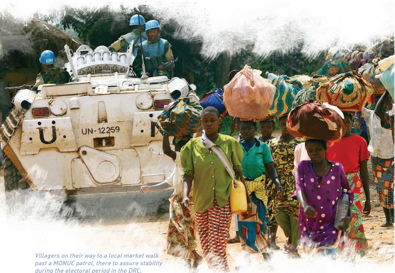
Villagers on their way to a local market walk past a MONUC patrol, there to assure stability during the electoral period in the DRC.