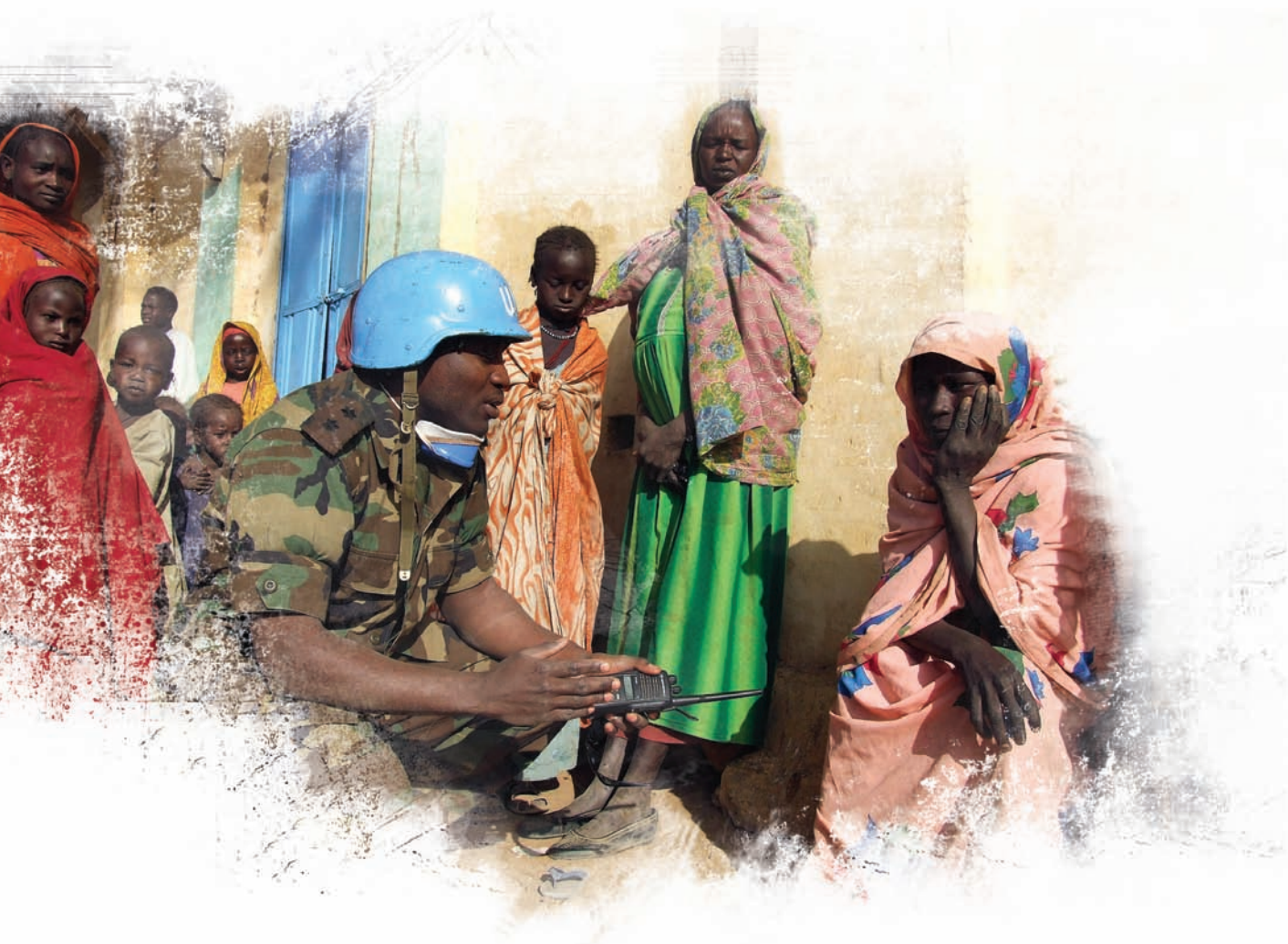
A UNAMID peacekeeper on patrol consults a woman regarding her concerns.