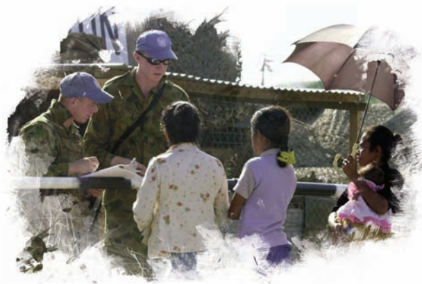
East Timorese women speaking to peacekeepers providing security at the border.

The roll-out and distribution of this knowledge product, financed by the Government of Australia, will include the development of training material as part of a package being developed by DPKO Integrated Training Service (ITS) on the protection of civilians. There will also be continuing capture of the kinds of tactics identified in this paper to build a “bank” of good practice. Indeed, since this process began, there has been a virtuous cycle of increased attention to sexual violence leading to more concerted efforts on the ground.